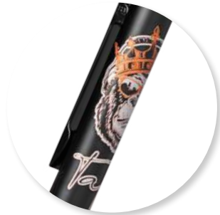
laser engraving 300°