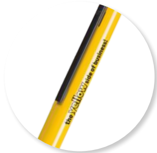
silkscreen printing 300°