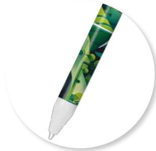
digital printing 360°