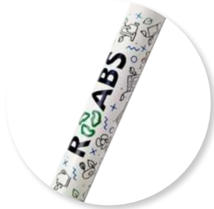
silkscreen printing 300°