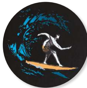
embossing + metallic foil