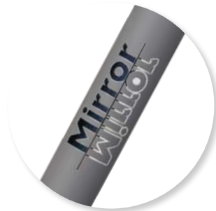
laser engraving mirror 300°