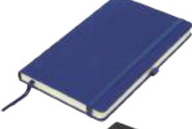
26 PMS 654C