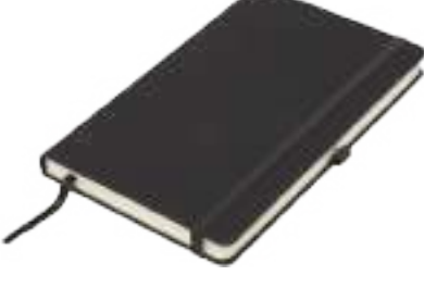
35 BLACK C