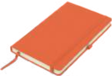
05 PMS 1645C