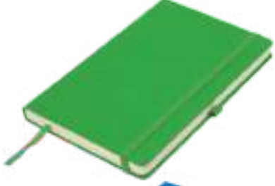
15 PMS 355C