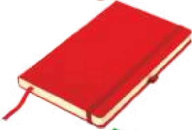
08 PMS 200C